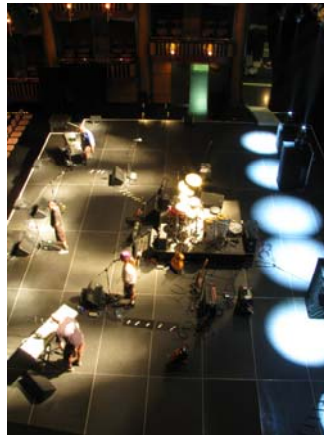
Arena Stage View from US Spot Positions

Check with CCPA Electrics department regarding availability of moving light package